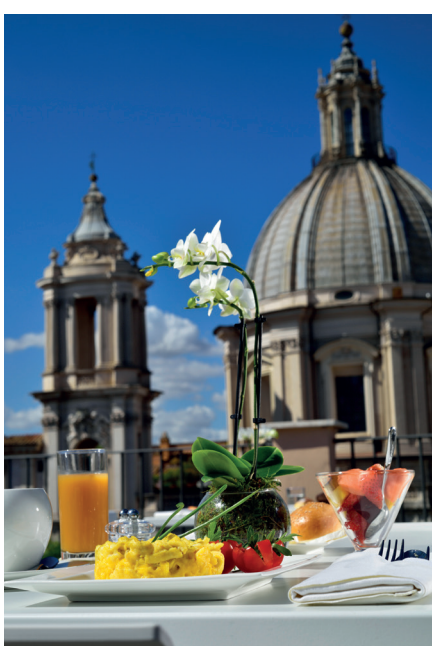
"We believe true luxury comes from small details that shine throughout our whole project. From the attention to detail of our incredible staff, to the custom design of every room, to even the simple pleasure of finding yourself in a location unlike any other. This is our interpretation of what true luxury is supposed to be."